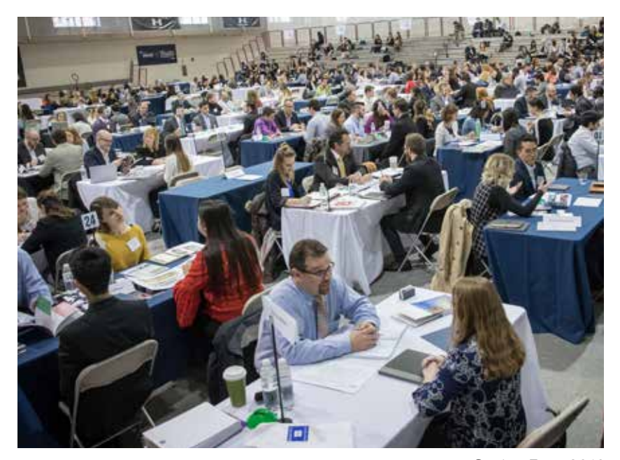
Design Expo 2018

The HireJefferson job board received 1,488 job postings (89% of which are internships or entry-level jobs), by 592 unique employers.