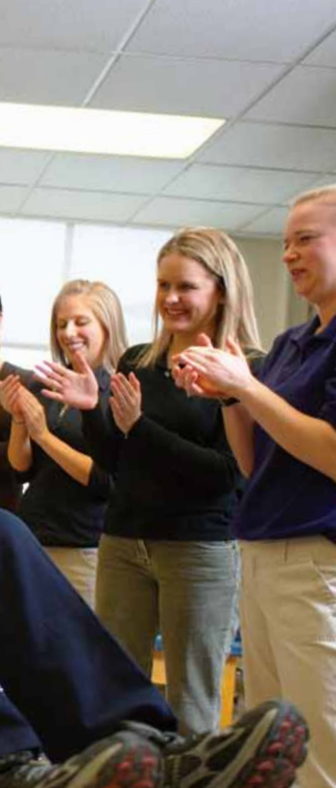
ABOVE: A PT STUDENT DEMONSTRATES THE DIFFICULT TASK OF PERFORMING A "WHEELIE," NECESSARY TO GET OVER CURBS WHEN USING A WHEELCHAIR.