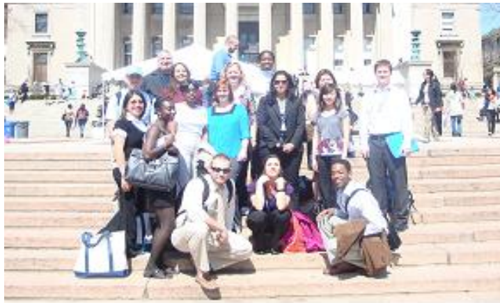
A photo of RWJ grantees at the Isabel Stewart conference, Teachers College, Columbia University.