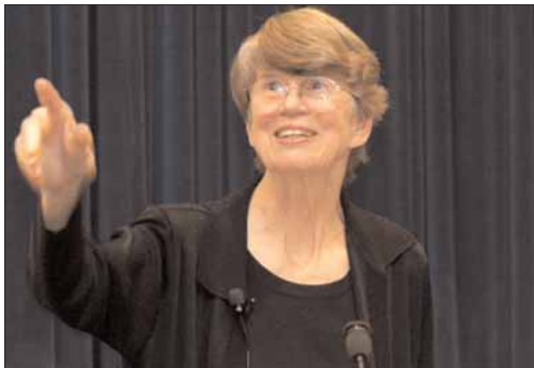
Former U.S. Attorney General Janet Reno takes a question from her Jefferson audience after sharing her 'personal perspective' on Parkinson's disease.

Ms. Reno, the 78th attorney general of the United States and the first woman ever to serve as Attorney General, the nation's top law-enforcement job, revealed in