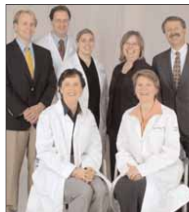
Jefferson's Palliative Care Service providers work alongside the primary health care team to control pain and severe symptoms as well as support the patient and family during serious illness. A physician may request a consultation using the hospital's computer-based ordering system or by calling a Palliative Care Service member on pager 877-656-4509.