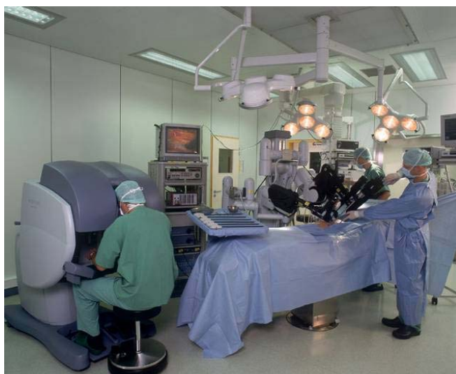
Figure 1. da Vinci ® Robotic Surgical System

Early data on robotically-assisted radical prostatectomy (RALP) is promising. As more groups ascend the learning curve, reports in the curve, reports in