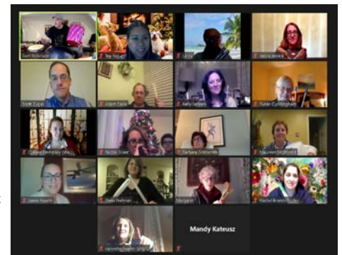
JCHP faculty and staff at the virtual Drum it out workshop on December 9, 2020