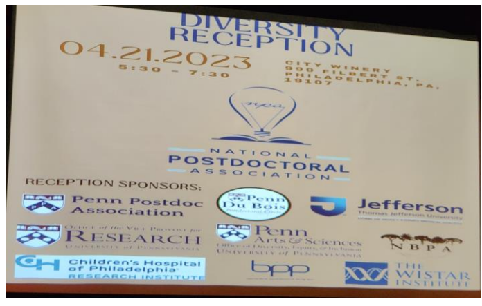
Diversity Reception event attended by NPA2023 attendees