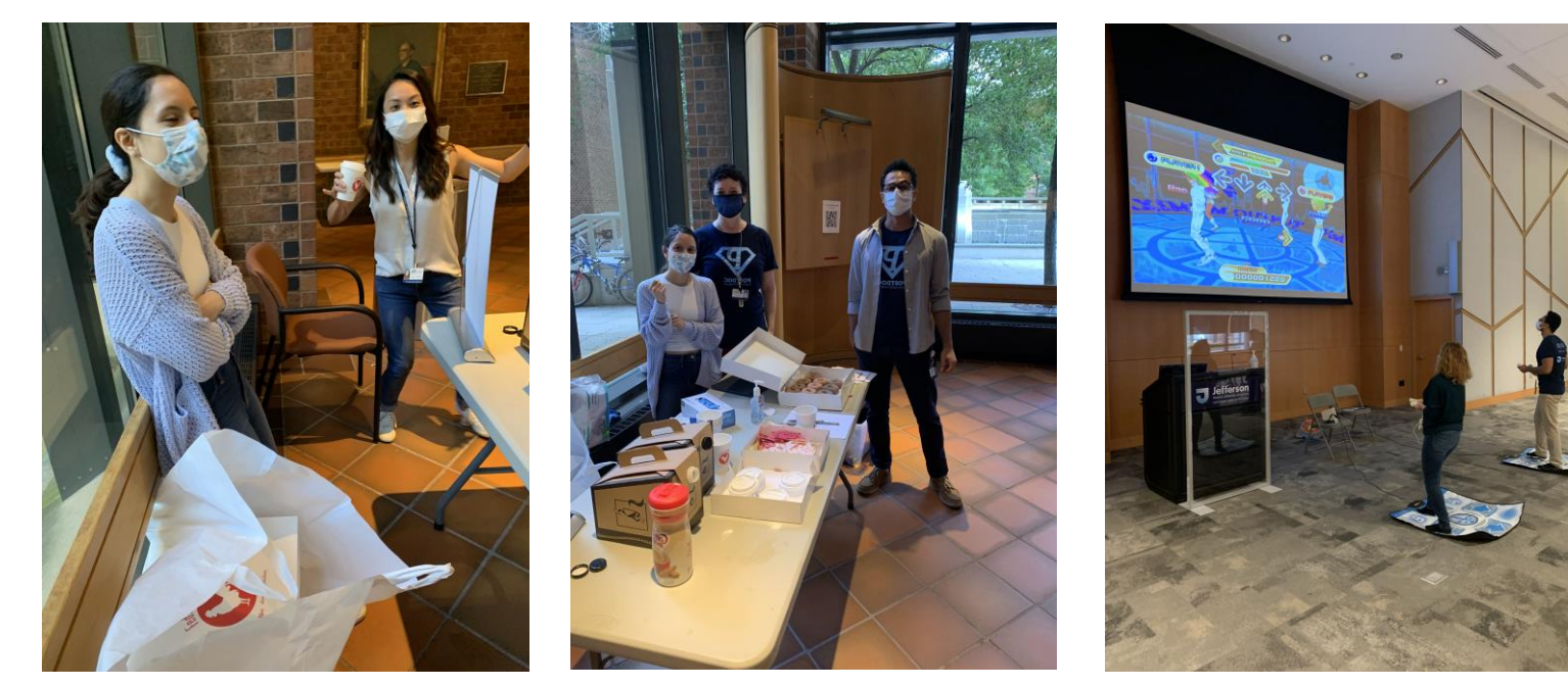
JPA board members and Jefferson postdocs enjoying one of the many social events organized by JPA

Every year, the JPA has been organizing events throughout the week, using various themes to help make the events memorable and enjoyable for their fellow colleagues.