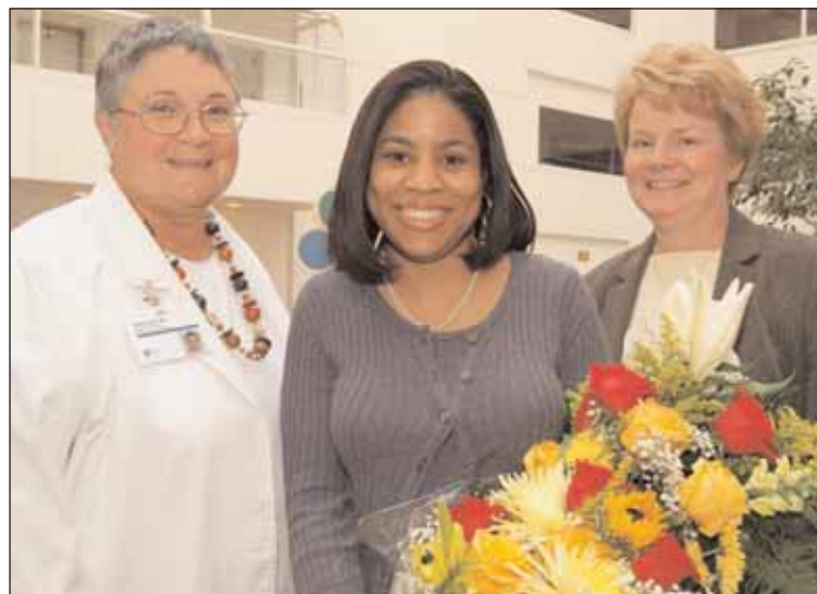
Robert Neroni Photography

The success of the hospital's Sickle Cell Day Unit is in large part