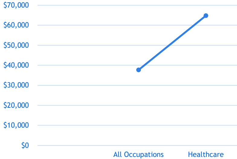
Median Annual Wage